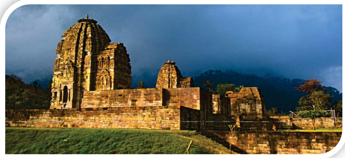
Krimchi has one of the oldest temple complexes of Jammu