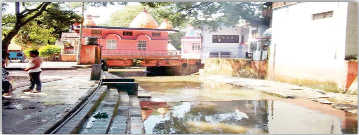
The 'Devika' River Udhampur